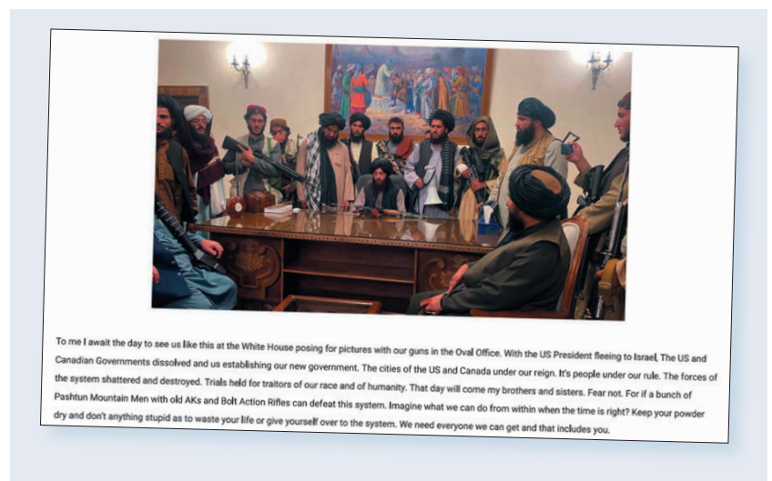
Figure 4. Screenshot of an August 2021 neo-fascist accelerationist blog celebrating the Taliban takeover of Afghanistan.