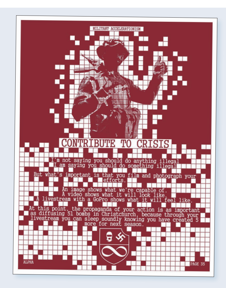
Figure 8. Example of propaganda shared by a neo-fascist accelerationist about the importance of communicating symbolic violence.

Martyrology brings us to the next thematic overlap, which is the shared affinity for communicative and symbolic violence. While IS pioneered vehicle ramming attacks,42 it has become a common tactic of REMVE threat actors to target protestors and civilians.<sup>43</sup> Livestreaming mass casualty events, especially mass shootings, has also become a standard propaganda tactic. IS's burning of a Jordanian pilot and its beheading videos that horrified the world set the tone for self-publicised terror media that was no longer dependent on global media outlets for distribution. Social media platforms provided new opportunities to broadcast terror to anyone with an internet connection. Most notably for REMVE threat actors, the massacre in Christchurch was livestreamed by the shooter from a first-person perspective, a method first used by jihadists.44 Livestreaming has become a common way to disseminate and communicate symbolic acts of violence. The goal is not necessarily recruitment, but to contribute to the appearance of a growing crisis, to force governments and platforms to react to these incidents and threat actors (see Figure 8).