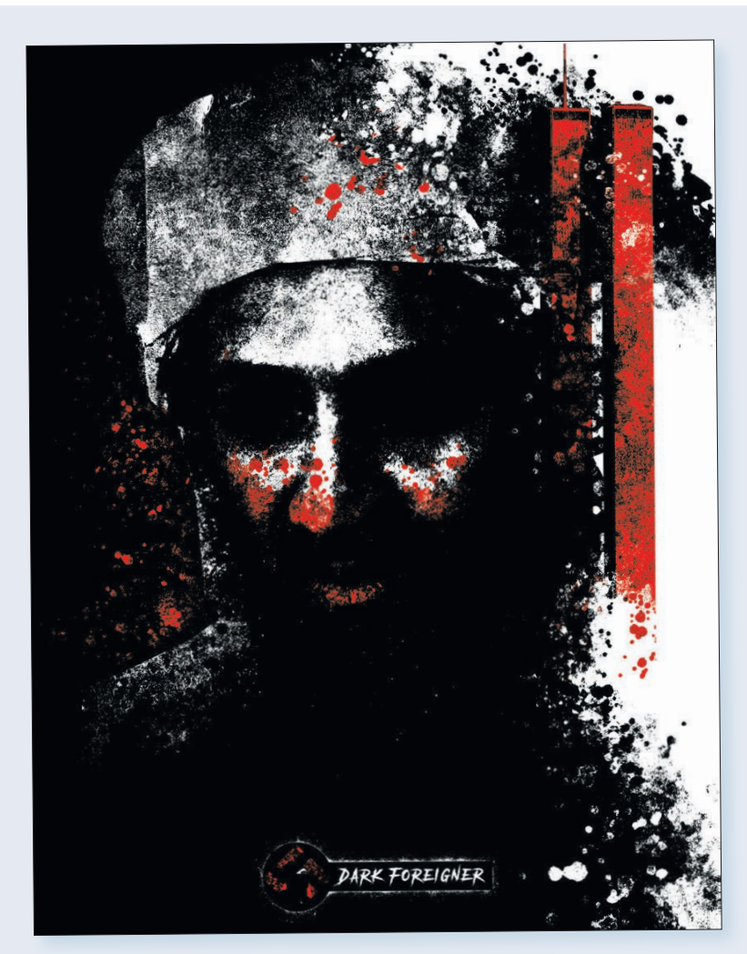
Figure 3. Dark Foreigner was a REMVE propagandist who started leveraging jihadist figures in his violent extremist art and propaganda.<sup>18</sup>

The United States' exit from Afghanistan in the summer of 2021 was discussed widely in REMVE ecosystems. In neo-fascist accelerationist spaces, the Taliban were touted as an example to be emulated by white Aryans in their own nations. The Taliban serve as a counter-argument to what REMVE actors call "movementarians" who want to work within the system, still believe that there can be a political solution or that the system is too big to be fought. An article on the American Futurist noted, "For this is clearly not true whatsoever. If it was then how come these Pashtun Islamic Scholars with old firearms and homemade bombs can completely humiliate NATO on the battlefield?" The Taliban was able to fight NATO and the USA for twenty years as an insurgent force and won. The Taliban victory