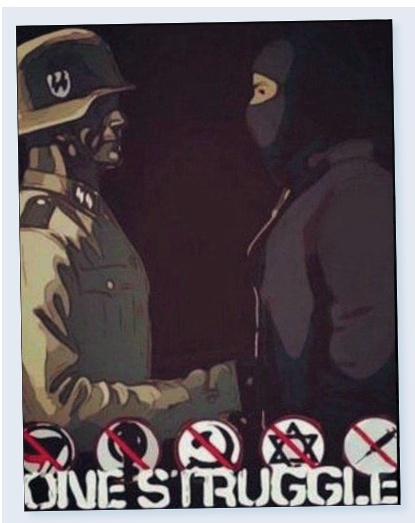
Figure 1. Meme depicting far-right movements and salafi-jihadism as "one struggle" against antifa, gender equality, communism, Jews and vaccines. Meme captured by researchers at the Institute for Strategic Dialogue. Used with permission.