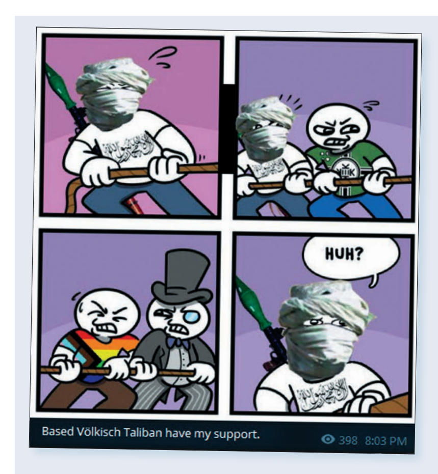
Figure 11. Meme made from an edit of a comic from a prominent white-nationalist webcomic creator depicting a salafi-jihadist aided in a tug-of-war against representations of LGBTQ+ people and wealthy capitalists by an individual wearing a "Kekistan" flag shirt.

reinstated, be it on gender roles, or the blocking of minority groups' (racial or religious) rights and access to power, and sexual 'morality' (in other words a hostility to homosexuality and other sexual orientations and sexualities that differ from what they view to be the 'norm')."55