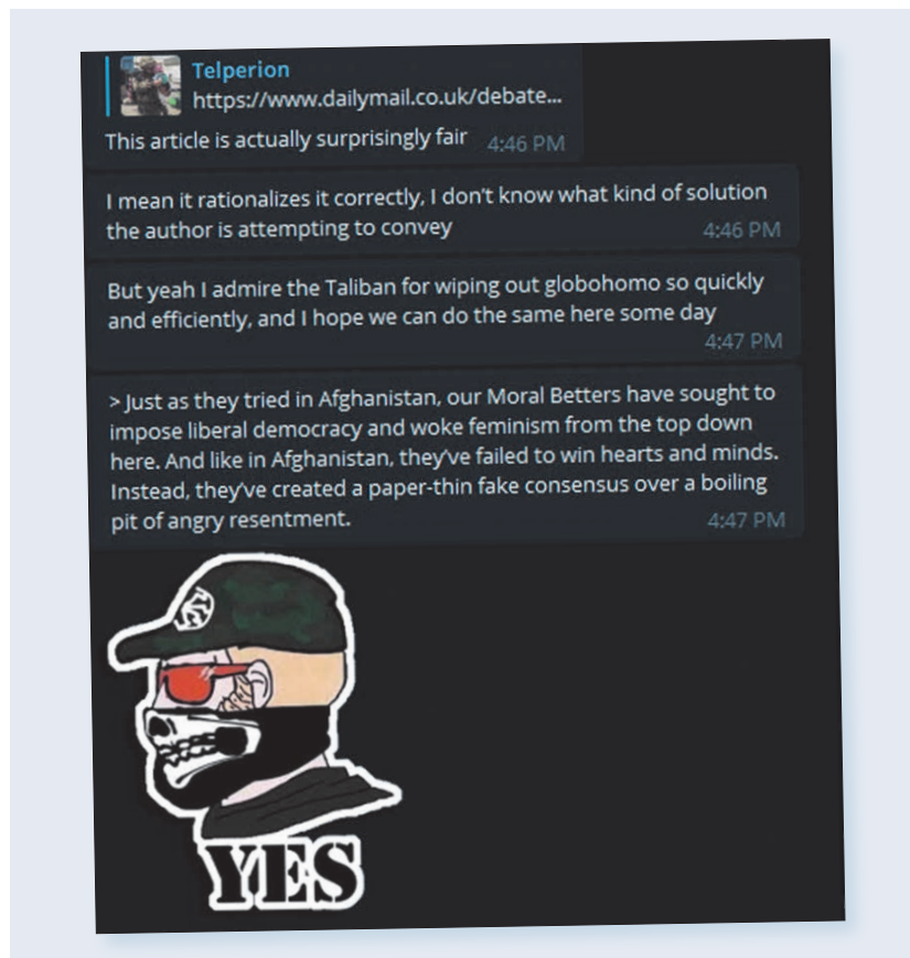
Figure 12. Telegram conversation about how the Taliban was successful in combating societal degeneracy.

From the perspective of neo-fascist accelerationists, the Taliban was able to defeat not only the "degeneracy" that was occurring in its own country, but also overcome the progressive liberal "degeneracy" that the West was trying to impose on it. This was a topic that was often discussed in the summer of 2021 on Telegram (see Figure 12), as the Taliban was taking over Afghanistan and reports of violence and killings of members of the LGBTQ+ community were circulating. The way that the global alliance led by the United States failed in Afghanistan is used as an example of how the continuation of progressive policies will lead to the system being destroyed, as more Aryan men decide to rise against it.