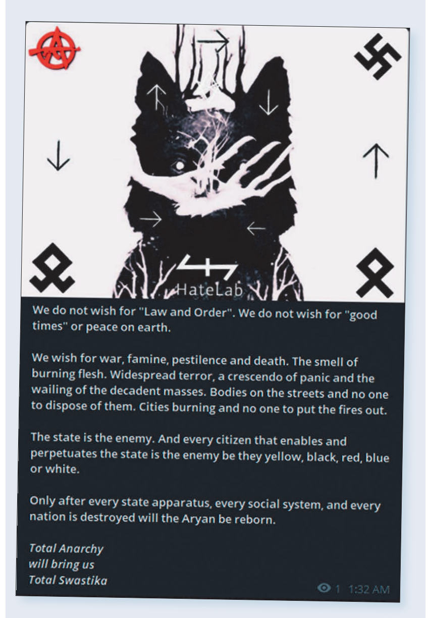
Figure 9. Example from a neo-fascist accelerationist Telegram channel of the perception of an imminent end time.

Recent manifestos by the Terrorgram Collective, the works of James Mason and the ideological and cultural media created in neo-fascist accelerationist ecosystems are couched in familiar tones of apocalypse, global change and epochal upheavals. Neo-fascist accelerationist propaganda, publications and podcasts are rooted in apocalyptic despair and millennial fervour. They see this same fervour in salafi-jihadists. For both threat actors, their apocalyptic despair is evident in their declaration of war against the West. Ultimately, as has been highlighted by Meleagrou-Hitchens, Crawford and Wutke, "These extremist movements have also made significant efforts to prove both the legitimacy and necessity of violence for the protection of their in-group and its interests. Both seek to either take part in,