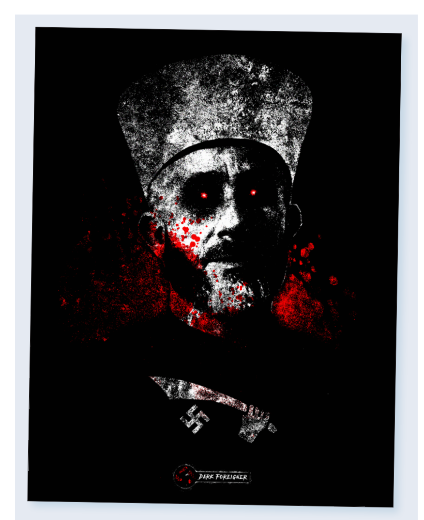
Figure 15. Meme by Dark Foreigner depicting al-Husseini.