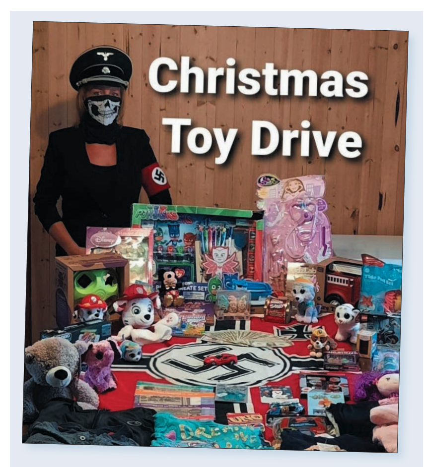
Figure 6. Example of a call by a far-right group to help members of the Aryan community.

This type of charity work earns the favour of a local community, encourages self-sufficiency and softens the image of REMVE actors. Actors can point to this type of work to indicate that they protect their own, that they are concerned with more than simply violence and that they are able to carry out the work that the government has failed to do. When engaging in these types of campaigns, REMVE actors have also emulated the Taliban's support for locals in Afghanistan and the similar efforts of al-Qaeda in Pakistan. Building goodwill in the local community was a critical TTP for salafi-jihadist insurgencies. While it has not gone unnoticed by neo-fascist accelerationists, it has nonetheless been a cause of friction between them and movementarians: the latter's public stunts, protests, violent acts and propaganda are often viewed by the former as ineffective at aiding the destruction of the system. Instead, accelerationists argue that movementarians actually harm the image of those trying to work against the system by building trust within their local communities and "tribes".