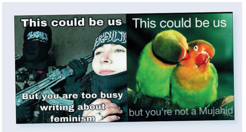
Figure 14. Memes advocating for and romanticizing traditional gender roles, suggesting that a better, more authentic relationship could be had, if men and women each embraced their "true" gender roles.

insurgents. However, this is not the dominant depiction of women in most propaganda. Both sides frequently make and share memes about how feminism is corrupting women and driving them away from their responsibilities as mothers. The narrative overlap regards feminism as a progressive liberal and Jewish tool used to weaken society by destroying traditional societal and familial structures.