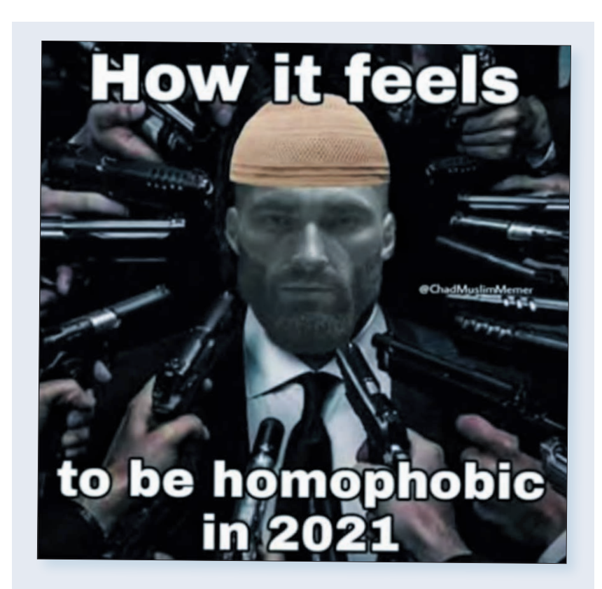
Figure 13. Meme captured by ISD: "A GigaChad wearing a Kufi – an Islamic hat – is being targeted for being Homophobic. The image is representative of the deep-seated hatred for the LGBTQ+ community within Islamogram." <sup>63</sup>

On the salafi-jihadist side, researchers at the Institute for Strategic Dialogue have recently found an interesting cultural convergence as well. In their study of over 5,000 memes and over 3,500 videos, they found that a new generation of salafis from around the world was blending "traditional Salafism with alt-right-style activism by drawing on ubiquitous gaming and wider internet subcultures" and "adopting, altering and amplifying chan communities, alt-right and far-right narratives, and in some cases glorifying Nazism".62 As noted above, while historically far-right movements have respected and sought to emulate jihadist groups, their admiration was not reciprocated. However, a new generation of young salafis, who came of age in "chan culture" and on gaming platforms, has come to see far-right arguments against pluralism and progressive politics and for a return to tradition as a potential point of narrative convergence (see Figure 13).