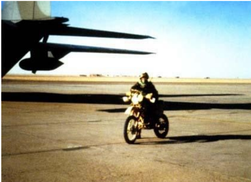
An SAS trooper and off-road Honda motorcycle beneath the tailplane of a C-130 at Victor, prior to deployment to Al Jouf in Saudi Arabia.