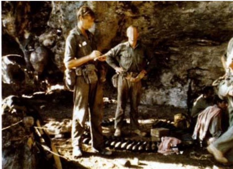
Captured adoo mortar rounds and other equipment being logged by SAS members during the final push in Dhofar. Seated at right are firqa – Dhofari irregulars loyal to the Sultan.