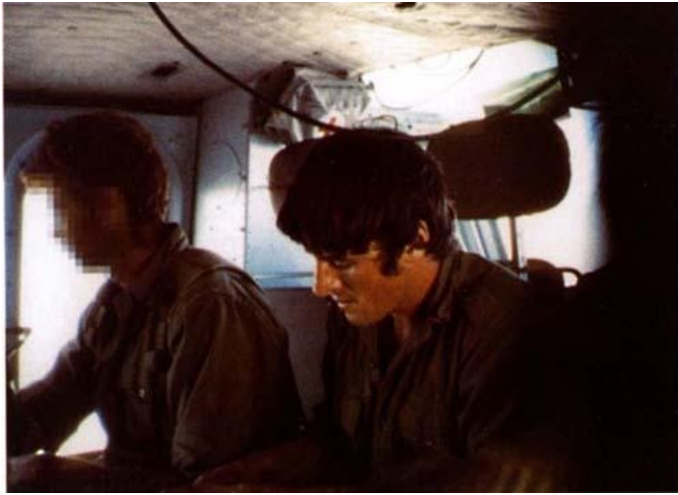
The author deploying to a new location by Huey helicopter during his third tour on Operation Storm, 1975.