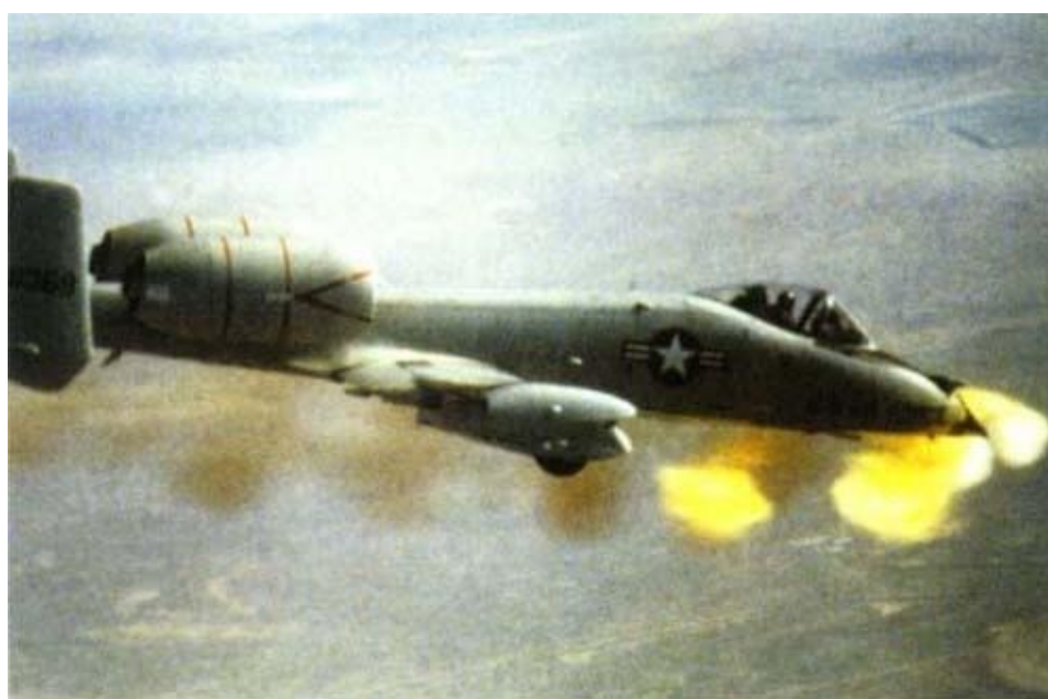
A USAF A-10 Thunderbolt – more usually known as the 'Warthog' – in action over