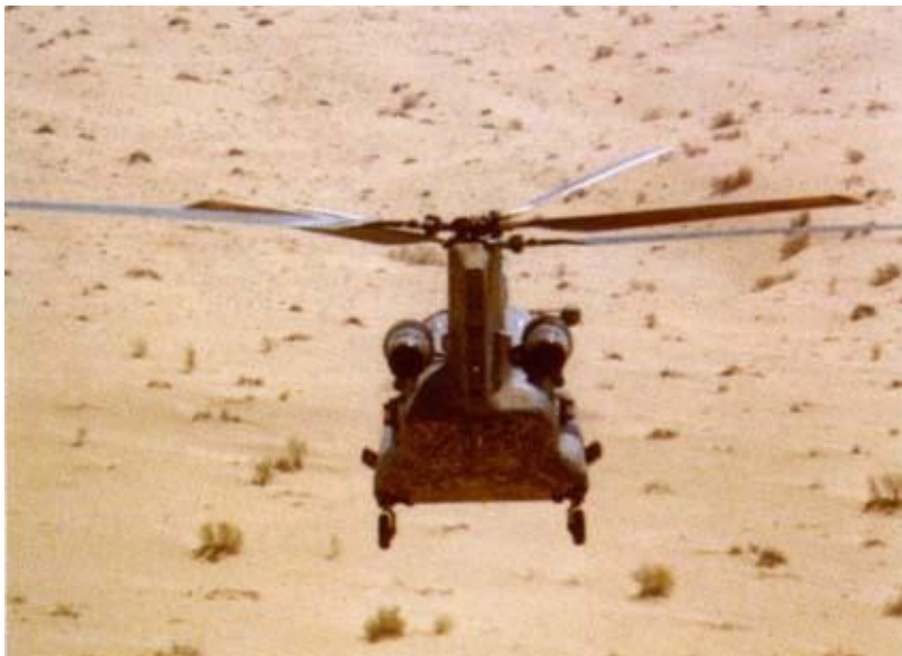
An RAF Special Forces Chinook flying low over the desert during the Gulf campaign.