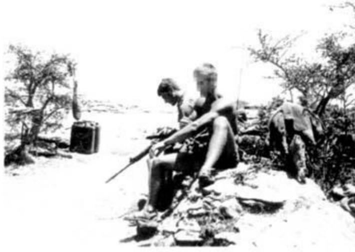
The author ( left ) and Taff cleaning their SLRs on Diana One.