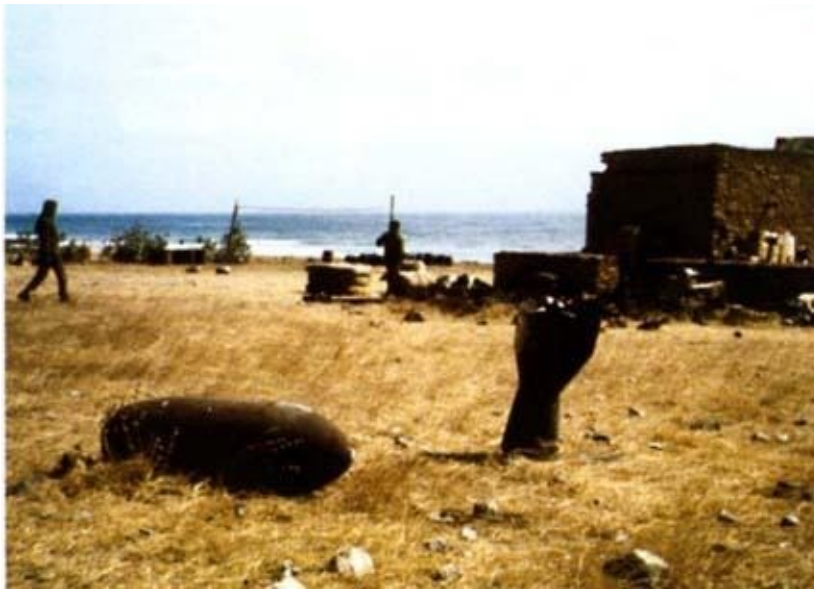
A captured adoo coastal location near the Yemeni border during the final push in Dhofar, September/October 1975. The troops are ge'ish, and in the foreground there is an unexploded bomb.