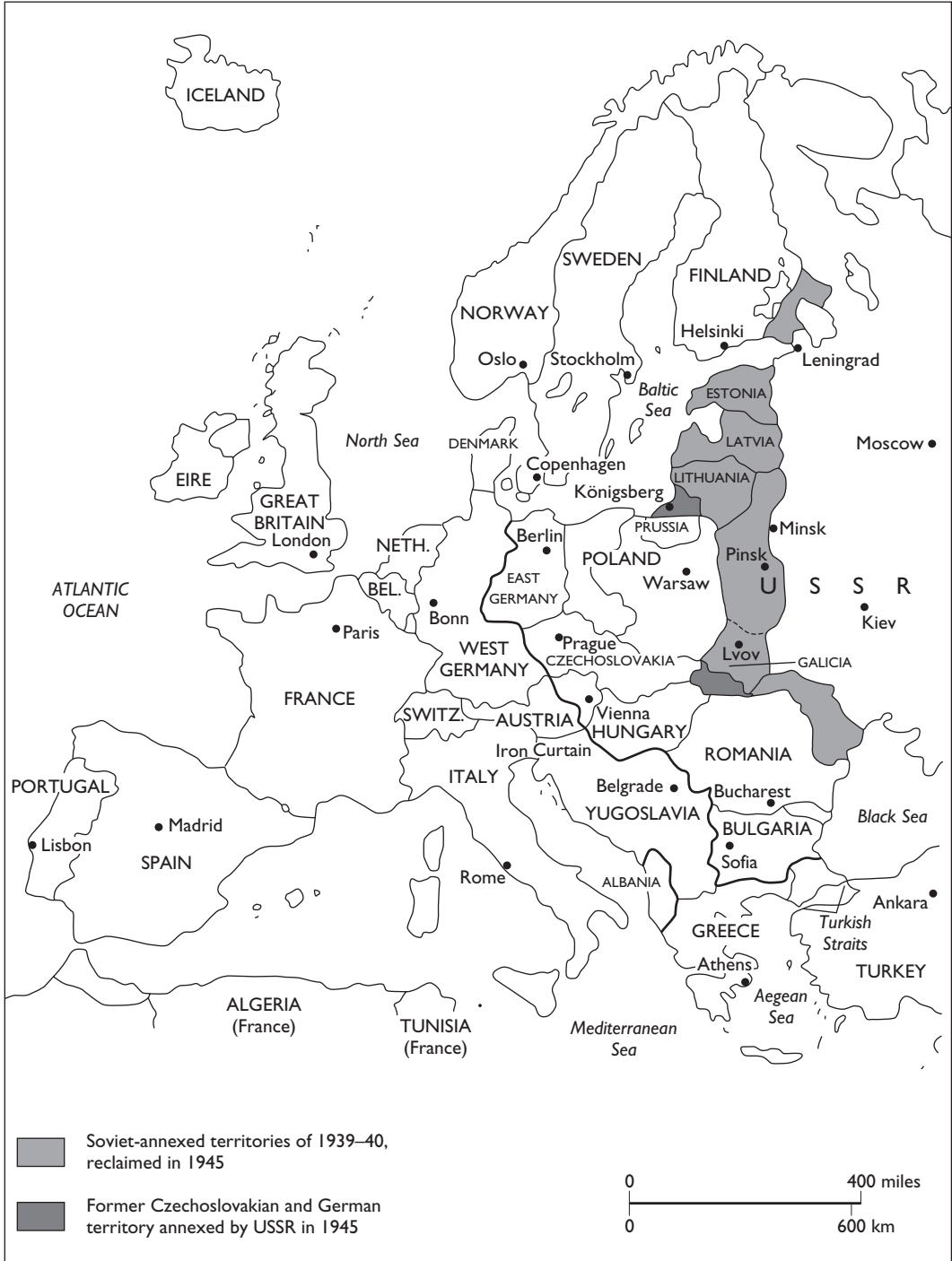
Map 4 Postwar Europe, 1945-52.