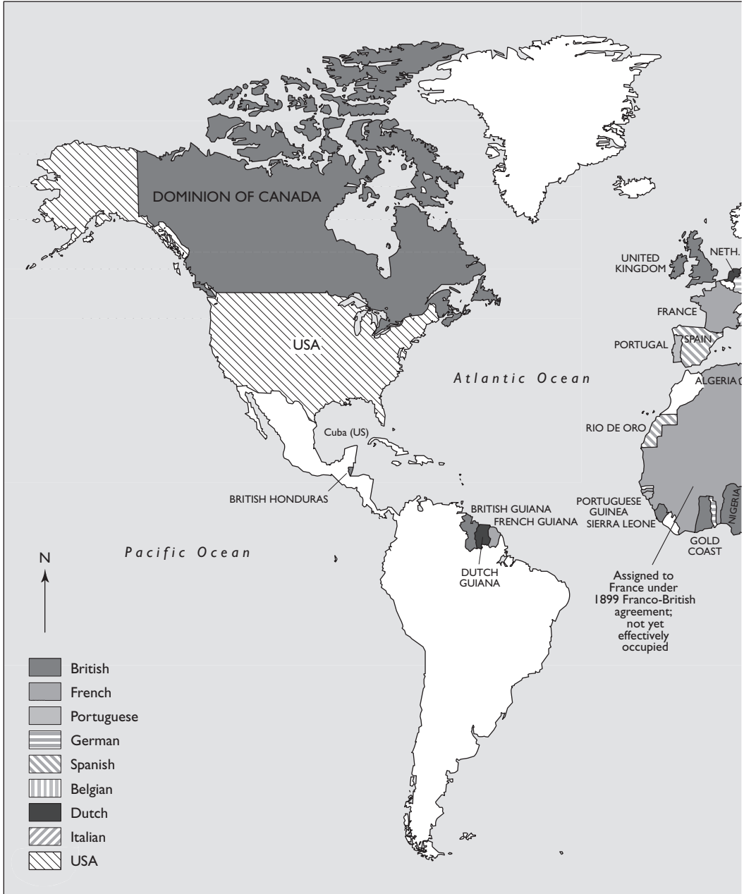
Map 1 European and American empires, 1901.