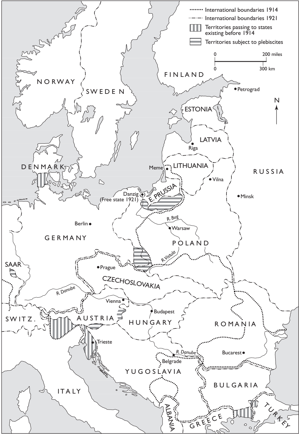
Map 2 The settlement of central and eastern Europe, 1917–22.