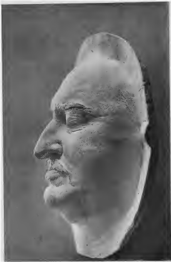
Rhodes' Death Mask