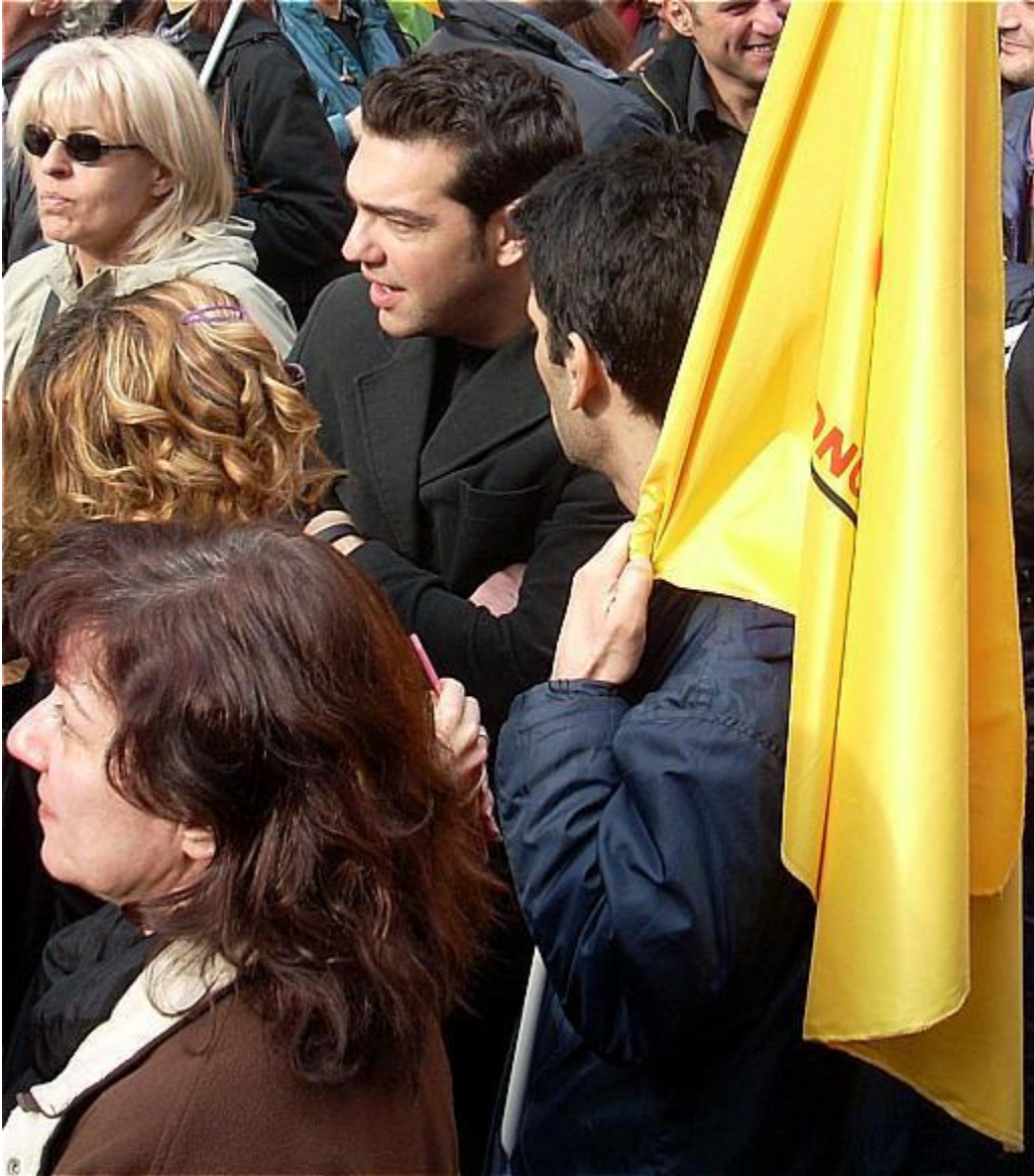
Tsipras-Leader of the pro-EU globalist ex-Euro's