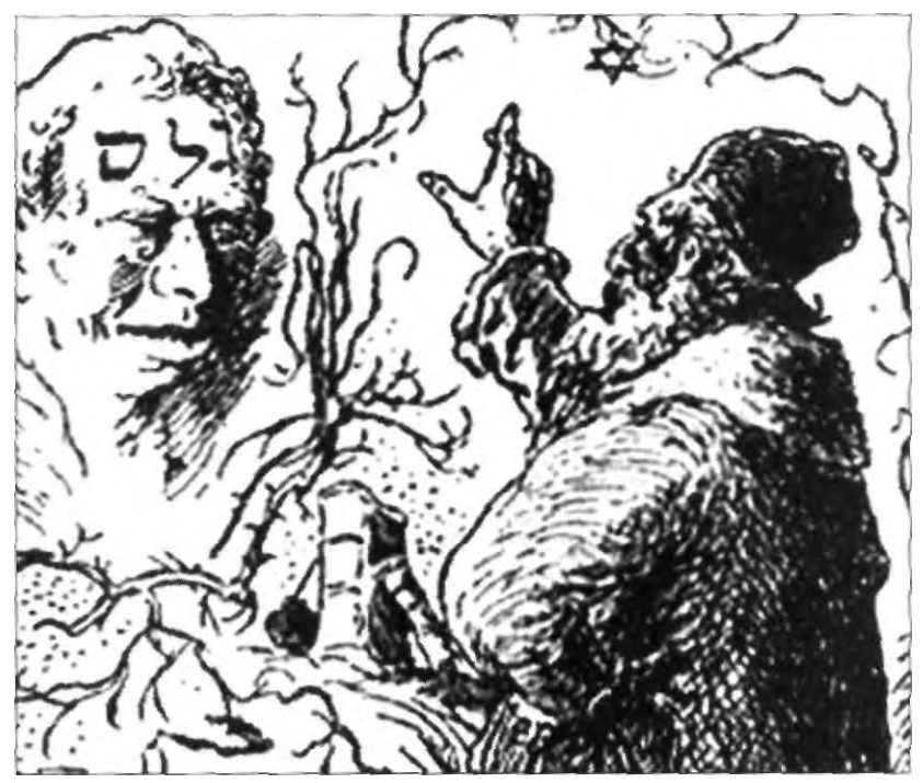
Above, a 19th century illustration of Rabbi Loew of Prague conjuring up the legendary Golem of Jewish lore. A real-life Golem exists in Israel today: its arsenal of nuclear weapons of mass destruction.