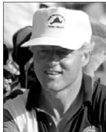
Among the U.S. presidents who were controlled by the political Zionists were (above, left to right): Jimmy Carter, Ronald Reagan, George Bush and Bill Clinton. At first, American patriots were hopeful that the current president, George W. Bush (son of George Bush), would turn out to be at least a little less pro-Zionist than Clinton. But recent events have revealed "W" to be a cat's-paw for Ariel Sharon and the Mideast ministate of Israel.