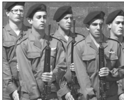
Guarding the Memory of the Holocaust