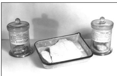
A picture of the gray disgusting material referred to as "soap." (See exhibit USSR-393).

Institute was the major source of skeletons for universities and schools. It appears that 100 to 200 bodies were used for that purpose yearly. Bodies were de-fleshed in large vats. Soviet investigators took the fatty mixture of human material left in the vats and presented it to the Tribunal as "soap."