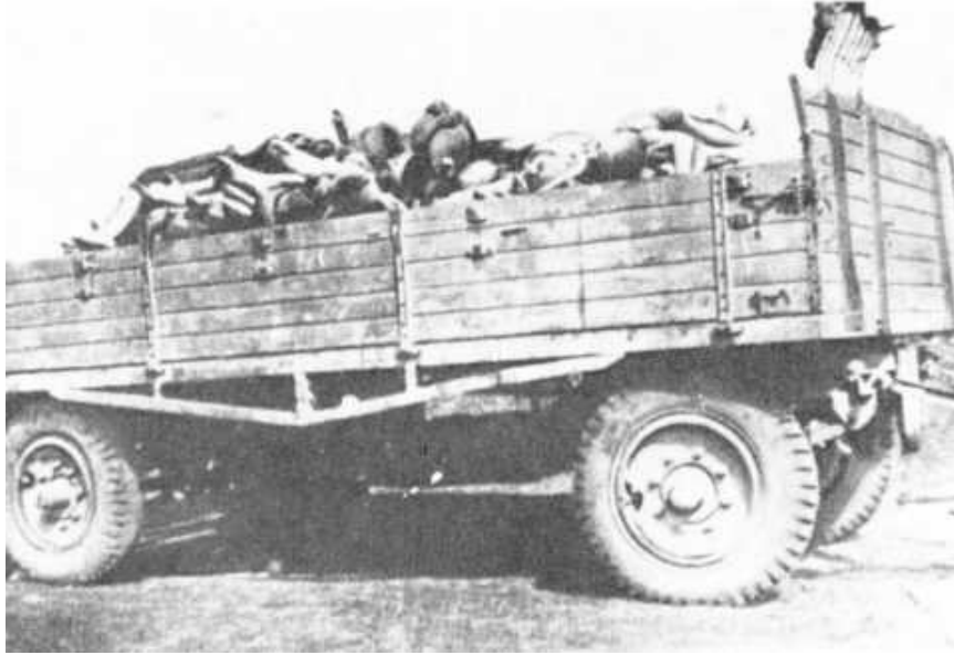
"Trailers with corpses of prisoners, CC-Buchenwald." Published with this text in R. Schnabel, Macht ohne Moral p. 343.

This picture is also fabricated. This is clearly recognizable by comparing enlargements of this print and the reproduction in SS im Einsatz Berlin East 1957, p. 193, and Buchenwald – Mahnung und Verpflichtung – Dokumente und Berichte , Berlin-East, no-date, picture supplement. The wheels differ. The legs in the back part do not fit anatomically and perspective to the front body parts. The unclarity of the load contradicts the clearness of the trailer parts.