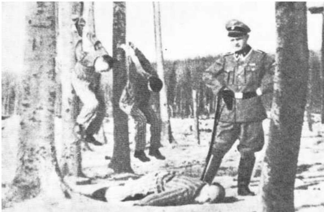
KZ-guard, victims in Buchenwald: "In the SS-government, the perfect slave system." Published with this text in Der Spiegel 10.10.1966 No. 42, p. 101.