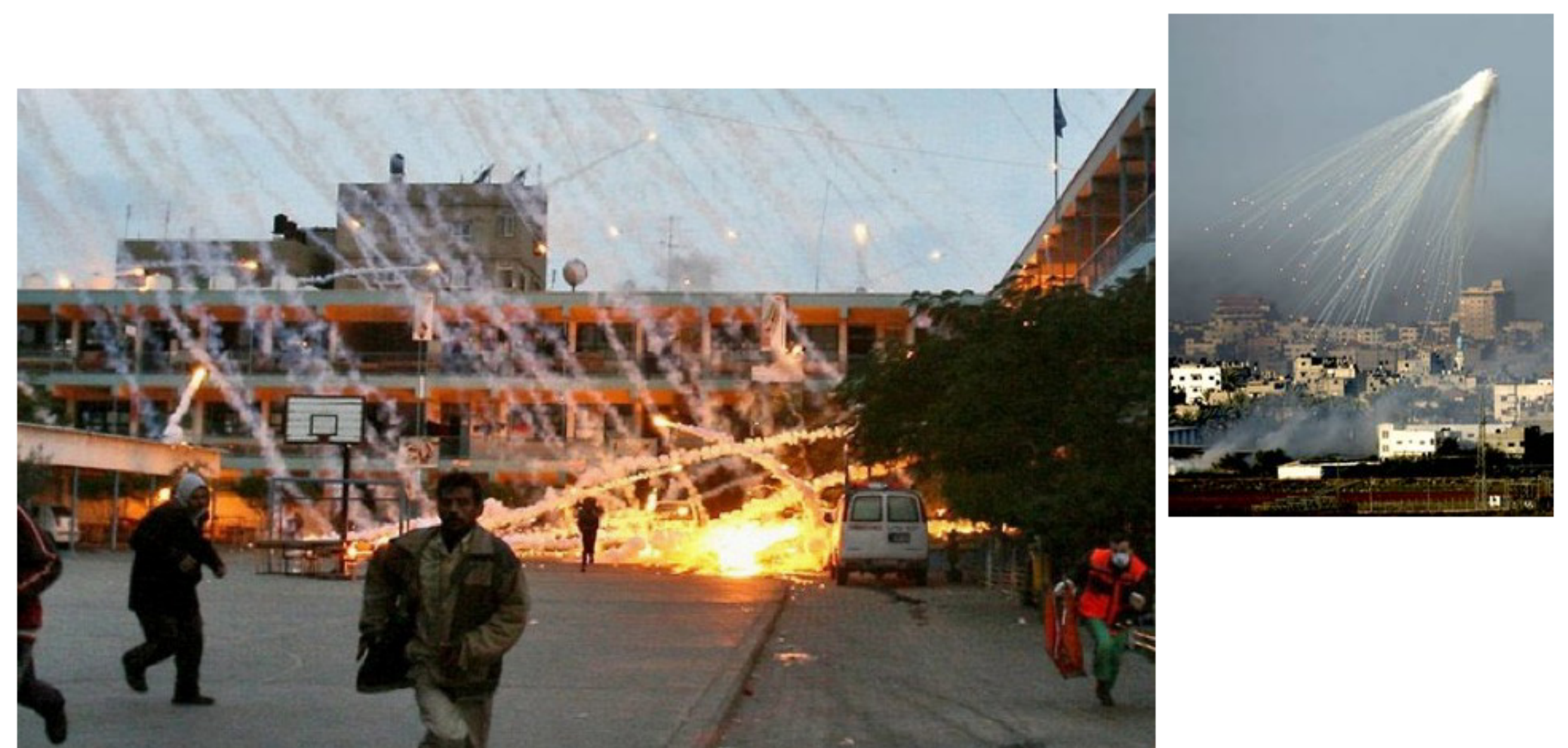
Persecution in Mideast A school in Gaza, 2009 Note basketball hoop on left.

The holocaust is a late-colonialist myth. The European Jews who went to Israel after WWII needed strong ideological justification after 40 years of fruitless attempts to obtain Israel. Your acquiescence is part of a comfortable college atmosphere for yourself, but leads to suffering in the Middle East. Why has not a single History professor ever said Yankel Wiernik is a fraud? Are you going to choose the comfortable academic life, or a very uncomfortable ostracized life by speaking the truth in order to save Palestinian, Iraqi, and Iranian lives? You're in a position to help the world at great sacrifice to yourself. What's your choice?