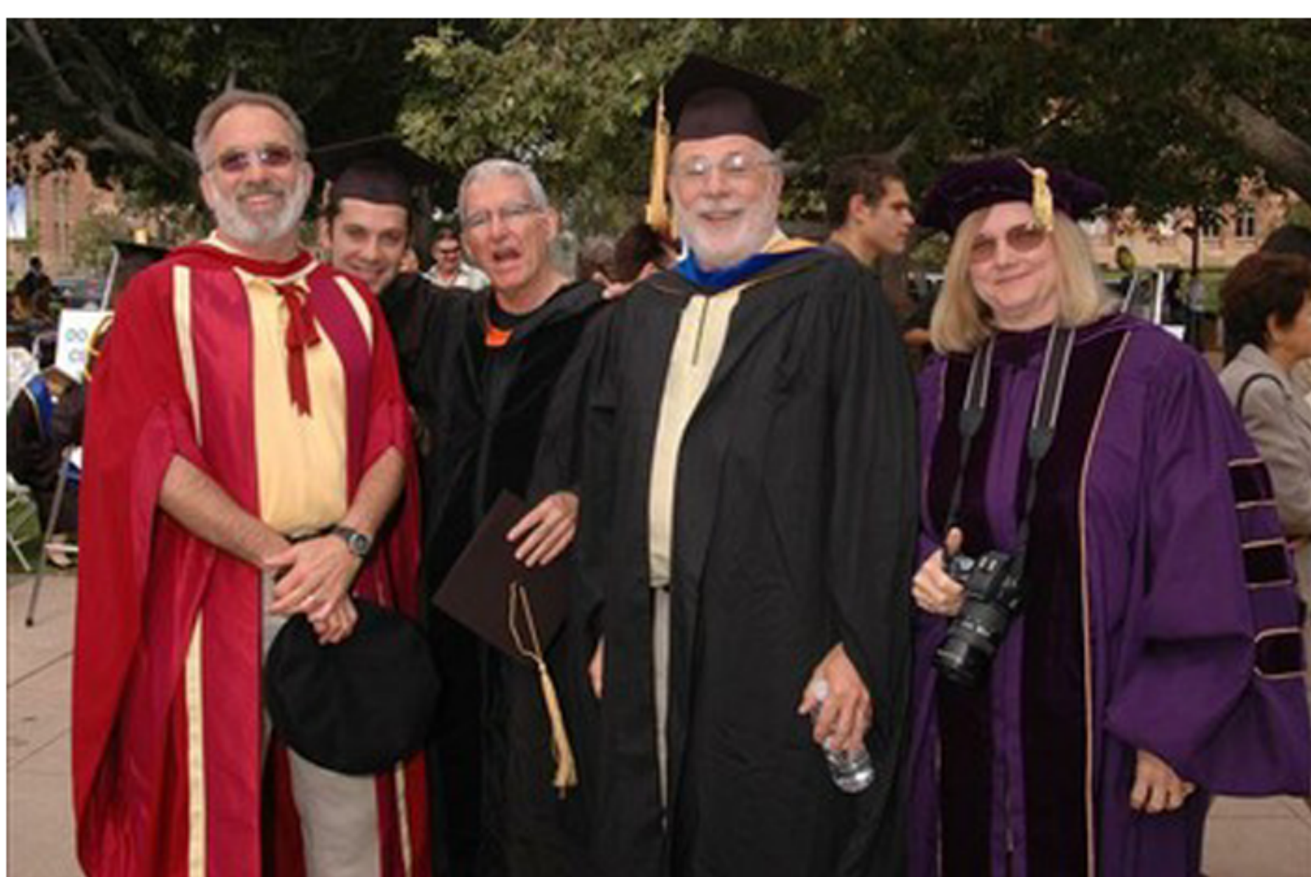
UCLA History Department Above random photo is used not to point out these specific members, but to denote H-depts. in general. 8

The Haircut: We're supposed to believe that it had nothing to do with delousing and had everything to do with the Germans going to all the trouble to cut 1,000 women's hair (in one batch) to make 3-4 mattresses. 7