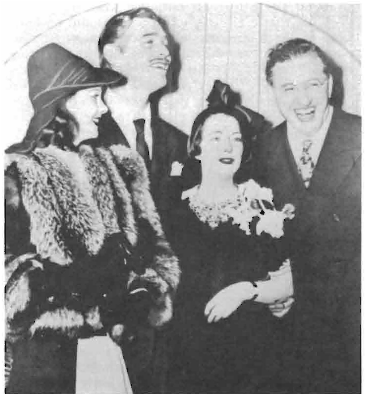
Margaret Mitchell with Leigh, Gable and Selznick

An early and admiring reader was Thomas Dixon, whose fiction had served as the basis for The Birth of a Nation . He sent the author a complimentary letter and she replied with a humorous account of her "dramatization" at age 11 of his book The Traitor . Part of Dixon's approval stemmed no doubt from the