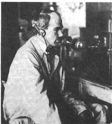
De Forest in his inventive heyday

Lee De Forest was born in Council Bluffs, Iowa. His father was a minister,