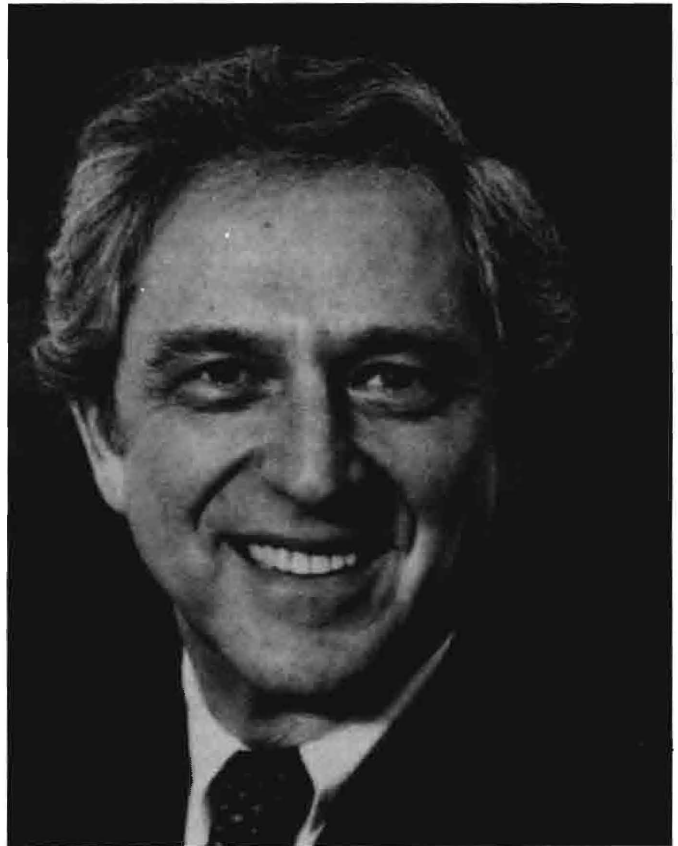
Dr. Edward Bloustein

Canada and Britain already have racial restrictions on free speech. Bloustein's new policy could be a trial balloon for future national policy in America. If university students can accept such limitations on freedom of expression in 1988, then perhaps the nation as a whole will be cowed by the time 1998 comes along.