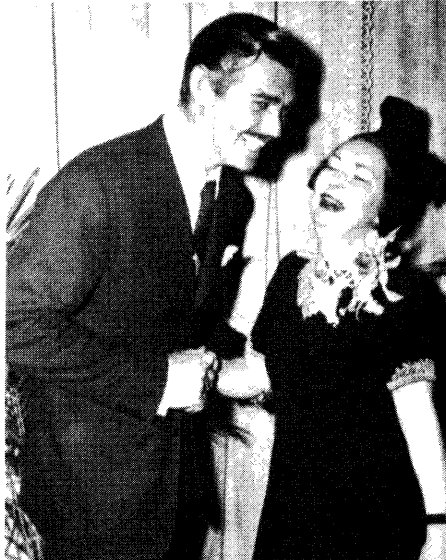
Gable with author Margaret Mitchell

pigmentation is described in Gone With the Wind as "black," "dark" and "swarthy," in contrast to Ashley Wilkes, who is "very white," Mitchell "consciously or otherwise" drew on her experience with virile black bucks to create the Southern swash-buckler in their image.