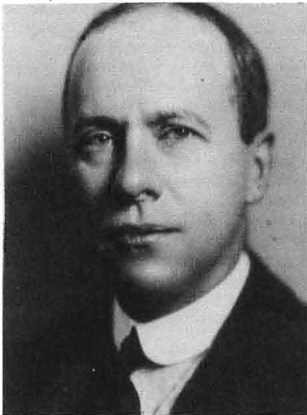
Stalin's favorite reporter

Walter Duranty, a Cambridge-educated Brit, was the New York Times correspondent in Moscow during the 1920s and 1930s. He became one of the most celebrated journalists in the world when he predicted that Stalin would succeed Lenin as Soviet dictator, and rode to even greater heights as a kind of participant observer of the negotiations that led to American diplomatic recognition of the USSR in 1933. Stalin personally thanked him for his work.